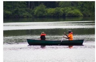
Children and youth can earn SMF Camp through Scripture memorization.

Scripture Memory Fellowship Camp is July 3-8 this summer! Come join us for five days of good fellowship, teaching, worship, and recreation at Southland Camp in Ringgold, LA. Young people, your memory work is your ticket to camp. Recite your whole age-level memory book at camp, and your week is free. Can't recite the whole memory book? We'll take $2 off full price for every verse you can say from your age-level memory book (in one-sitting, upon arrival at camp).